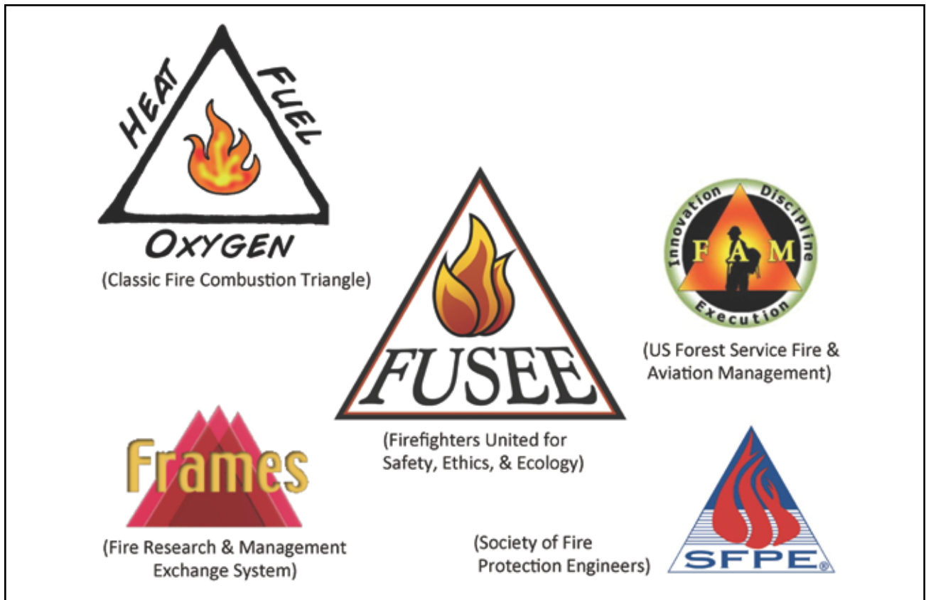
Figure 2—Pyroganda in logos: images as symbols used to create meanings and motives for action.