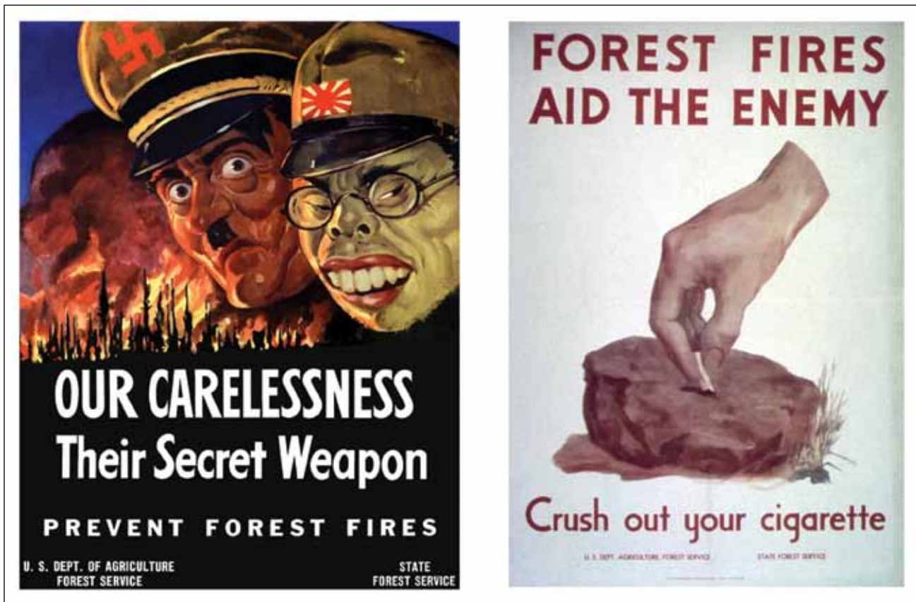
Figure 1—Examples of State-sponsored anti-fire pyroganda.