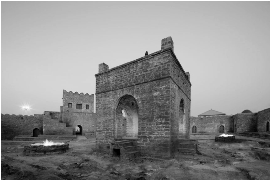
Ancient Zoroastrian fire temple of Baku

Although in every instant the flames of any given fire are a unique expression of spontaneous combustion, at the same time, the flames offer a universal, transcendent form that makes fire an enduring source of religious inspiration and meaning throughout the ages. The transformative power of fire to convert matter into energy has mystical qualities that help people merge with the metaphysical, and tune in to the spiritual. Fire is more than a land management “tool,” more than a manufacturing “power source,” it is a dynamic life force of Nature that should be respected, if not revered, for all the blessings it provides people and the planet. It could very well become the focalizing force for a resurrection of natural religion and renewal of Earth-based spirituality that will be needed to guide humanity through the great social and ecological changes ahead.